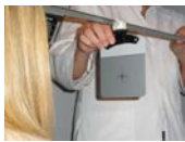
Nearpoint of Fixation Disparity Test (NFPD)

We propose to use the NFPD as a measure of the disruption of the accommodative-vergence system in athletes suspected of having sustained a concussion. Wearing polaroid glasses, the athlete views an E target at the center of a "plus" sign formed by two vertical and two horizontal arrows on the NFPD target. Although both eyes are able to see the E target, only the right eye will be able to see the top vertical arrow while only the left eye will be able to see the bottom arrow. Slowly (1-4-cm/s) the NFPD target is moved inward toward the athlete's nose, stressing both accommodation and convergence. The athlete indicates when the vertical arrows begin to slide or slip so that they no longer appear to be aligned with each other or the central E target. The distance at which the vertical lines on the target appear to become misaligned indicates the NFPD breakpoint and is recorded. Slowly the NFPD target is pulled away from the athlete's face and the athlete is asked to indicate when the misaligned vertical arrows again become perfectly aligned. This distance of realignment is then recorded as the recovery point. The task is repeated three times.