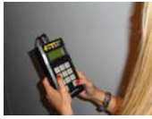
The FixTrain Device

We propose to use the FixTrain Device (Freiburg, Germany) as a way to measure anti-saccadic performance in athletes suspected as having sustained a concussion. The FixTrain is a small hand held device for testing/training of saccadic eye movement control and/or stabilization of fixation including visual attention and general concentration. 24 It has some similarity with computer games but with controlled effects on eye movement. Holding the device at a comfortable position, the fixation point in the center of the screen is shown to the athlete and after one second it is extinguished. 200 ms later, another stimulus (a star symbol) is presented randomly 4 deg to the right or left of center as a distractor. The athlete is instructed to look to the opposite side of the screen of the distractor stimulus where a small test stimulus is briefly presented in one of 4 possible orientations. The task of the athlete is to identify the orientation of the test stimulus. The best strategy to identify the orientation requires an antisaccade with respect to the distracting stimulus to identify the orientation by foveal vision. The athlete performs 100 trials of the task on the device (4-6 min), which then records the percentage of correct antisaccade responses.