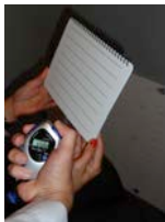
The King-Devick Test (K-D)

"No single test has been shown to quickly and reliably assess concussion in all cases. In addition, most of the current concussion tests have not been fully validated by scientific investigation." 1