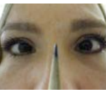
Repeated Nearpoint of Convergence Test (nNPC)

nNPC: It has been observed that the act of repeated convergence of the eyes to an incoming target by individuals who have suffered a traumatic brain injury may elicit a dramatic onset of severe nausea and/or vomiting. 3 The mechanism behind this phenomenon is not well understood, but recent studies have found that an autonomic nervous system (ANS) impairment of primarily adrenergic function will frequently occur in concussed individuals. 4 The ANS may be hypersensitive so that repeated convergence, a parasympathetic activity, may suddenly overwhelm the entire autonomic system creating a sudden onset of nausea symptoms and/or gastric distress. It is also possible that repeated convergence may excite the proprioceptive/stretch receptors of the medial rectus and trigger an oculocardiac reflex, which would result in an oculi-tingimus-ovago-abdominal (oculobulbomediastinal) reflex and create symptoms such as nausea and vomiting. 5,6