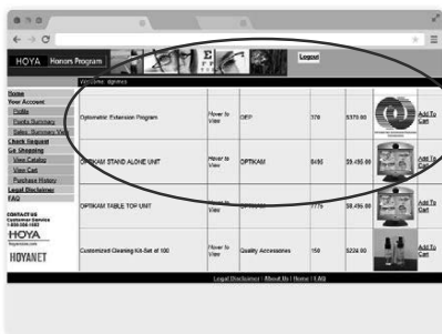
HHP Catalogue Page